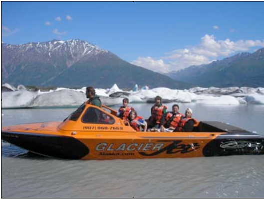
2007 campers enjoy Knik Glacier