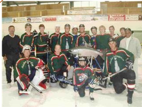
2007 Salmon Cup Champs

Also Featuring: Golf, Rafting, Glacier Tour, Baseball, Fishing, Music and more. . .