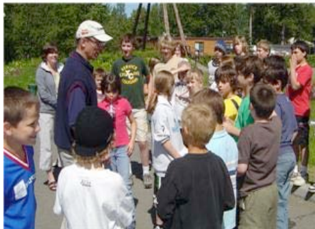
Igor Larionov visiting with campers at the 2007 Gomez Foundation Golf Tournament

Also Featuring: Golf, Rafting, Glacier Tour, Baseball, Fishing, Music and more. . .